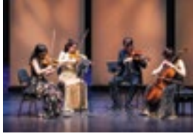
The Esmé Quartet performed for Musica Viva in May.