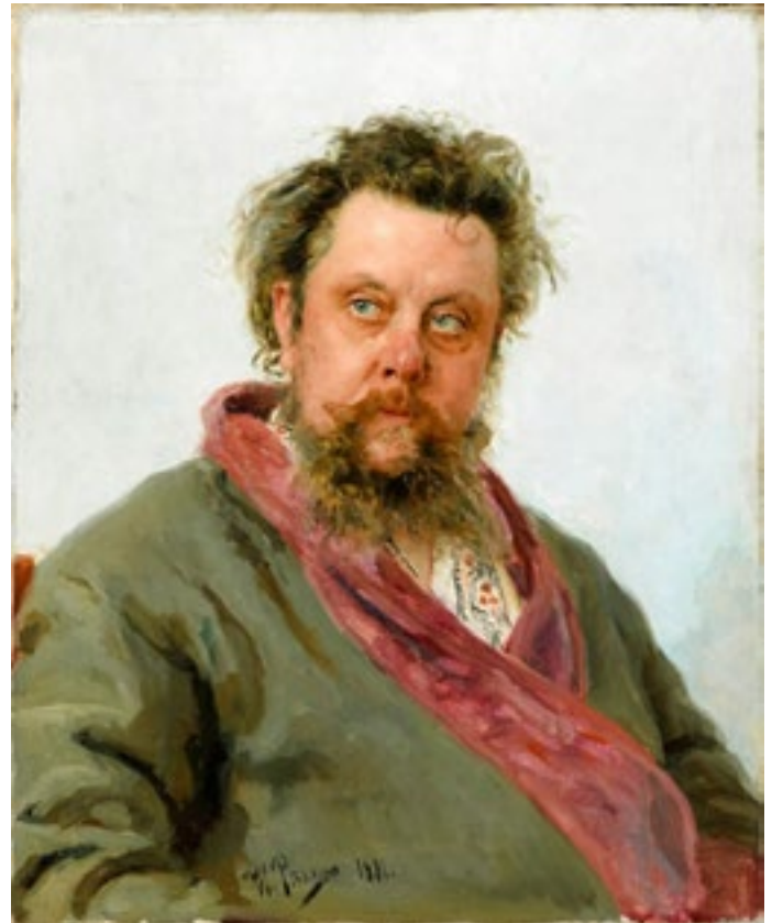
Modest Petrovich Mussorgsky (1839-1881), Russian Composer, portrait painting in oil on canvas by Ilya Repin, 1881

Mussorgsky demonstrated remarkable versatility in his compositional style to bring each painting to life. For example, his use of brass fanfares and sweeping melodies in The Great Gate of Kiev convey a sense of triumph, culminating in a majestic climax as befits the Hero's Gate as it was known. His haunting melody for In the Catacombs accompanies Hartmann's self-portrait carrying a lantern through the Paris catacombs, and the screeching chords depicting a witch's broomstick ride accompanies The Hut of Baba-Yaga , otherwise known as The House on Chicken Legs . Baba-Yaga of course being a witch from old Russian legend.