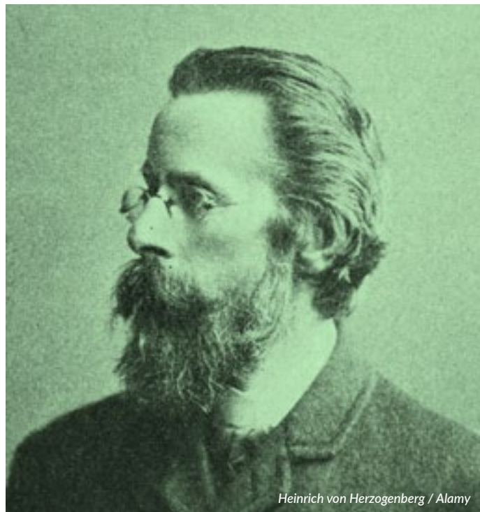
Heinrich von Herzogenberg

Elisabeth's death, in 1892, was undoubtedly a heavy blow for Heinrich, who subsequently devoted himself to his work. Later that year, he returned to his position at the Hochschule after a period of absence due to ill health, no doubt compounded by his grief over the death of his wife. Herzogenberg continued teaching until his deteriorating health forced him to retire in 1900. He died shortly afterwards.