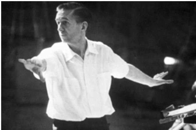
Jazz pianist, composer and bandleader, Gil Evans. He played an important role in the development of cool jazz, modal jazz, free jazz and jazz fusion, and collaborated extensively with Miles Davis.